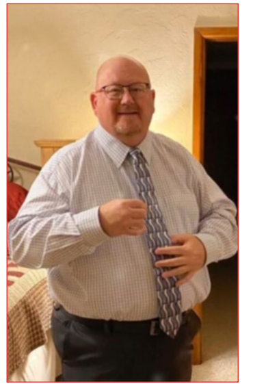
Rocky Ford